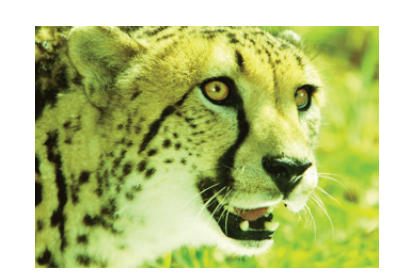
BEFORE auto wall correction