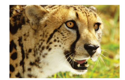
AFTER auto wall correction