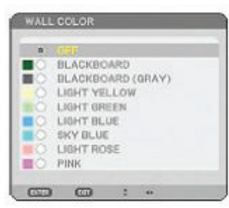
On a green wall...

These provide for adaptive color tone correction to display properly on non-white surfaces.