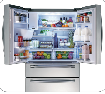
French Door Design