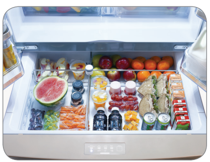
FlexZone Drawer with Temperature Control and Smart Divider